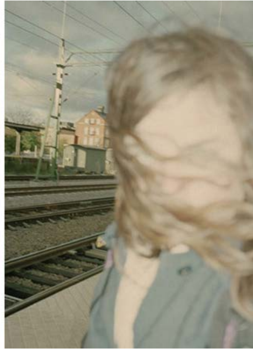
Agnes Thor, Untitled, Image from Artist website: www.agneskarin.se

While in contrast, Michael Schmelling shoots a pair of disembodied, blurred legs perched on a dashboard with a harsh frontal flash and over-saturated development. Both approaches make the viewer feel involved in the moment.