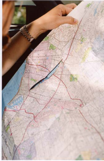
Michael Schmelling, Toes & Map, Image from Artist website: www.michaelschmelling.com

In conclusion, this new generation of photographers is endless because of the growing demand for socially accessible art. And although examples of informal photographers are not generation specific, much of this approachability emanates from popular youth culture. It is the youthful, easy-going and anti-formalist attitude in popular culture that is projected into informal art expression. Its 'incorrect' aesthetics, similar to family snapshots, lend a familiarity that connects the viewer with the intimate moment captured. The approachability of 'incorrect' photography in turn helps to disintegrate past borders placed between fine art photographers and popular culture.