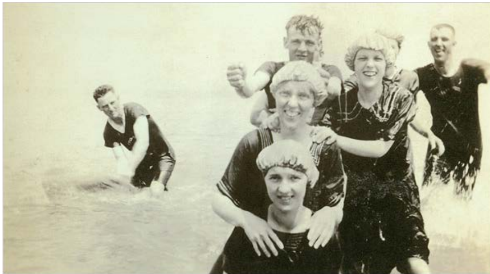
Found photos - FLOH by Tacita Dean

Not everyone is the same, not everyone is going to "escape" to a different place. Not everyone is going to look the same when they are "unmasked." Yet somehow, everyone does seem to resort to the same blank stare in the portraits of fine art photographers.